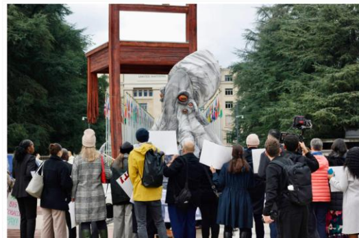
Exposing the deadly reach of Big Tobacco through street theater.

https://www.makebigtobaccopay.org/global-week-of-action